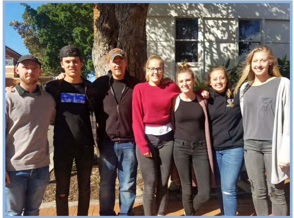
Capernwray Team 2018